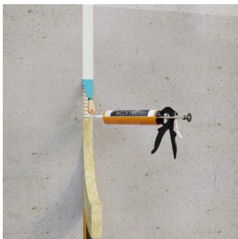
Fill the empty space with mineral wool and apply a layer of PIROSILICON 240 on both sides of wall