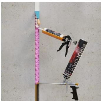
Fill the empty space with Piro Foam 240 and apply a layer of PIROSILICON 240 on both sides of wall