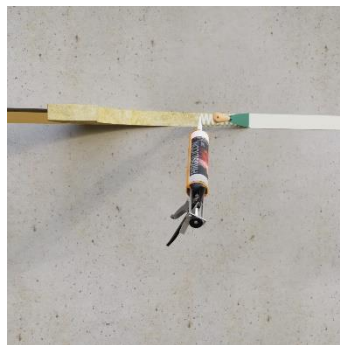
Fill the empty space with mineral wool and apply a layer of PIROSILICON 240 on both sides of wall