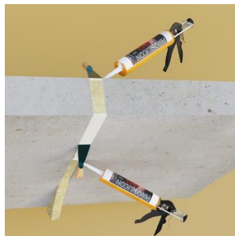
Cross-section of vertical expansion joint filled with mineral wool and a layer of PIROSILICON 240