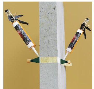
Cross-section of horizontal expansion joint filled with mineral wool and a layer of PIROSILICON 240