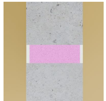
Cross-section of already filled with Piro Foam 240 and PIROSILICON 240 horizontal expansion joint

More information on applications and instructions can be found at: