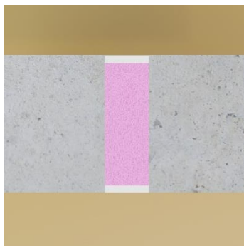
Cross-section of already filled with Piro Foam 240 and PIROSILICON 240 vertical expansion joint