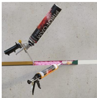
Fill the empty space with Piro Foam 240 and apply a layer of PIROSILICON 240 on both sides of wall